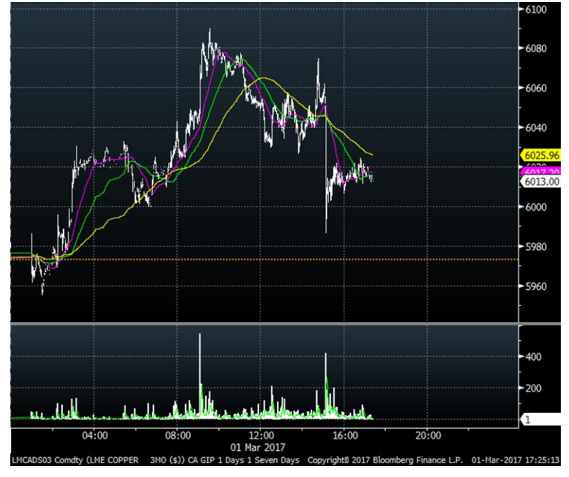
LME Copper 3M chart